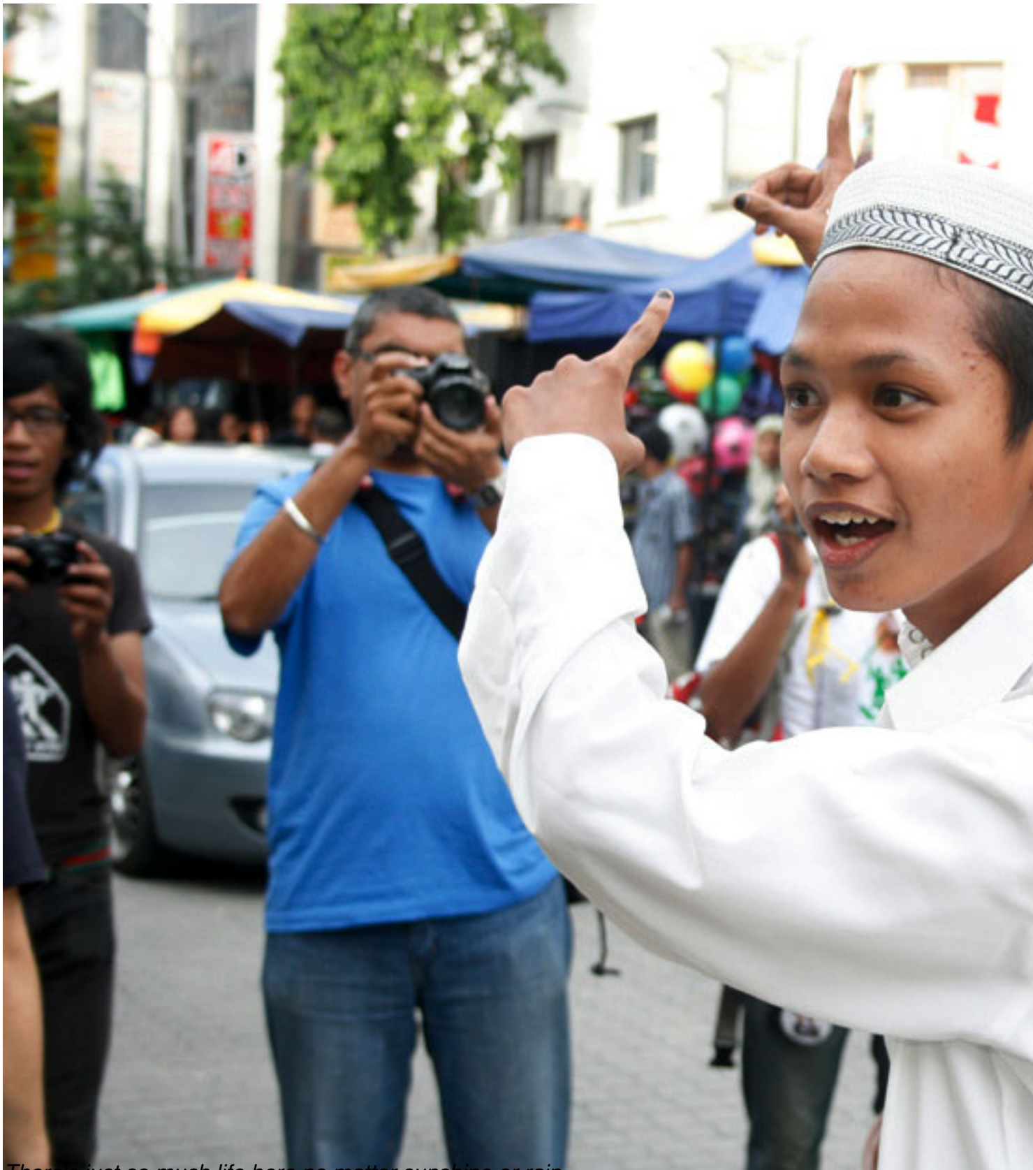
There's just so much life here no matter sunshine or rain