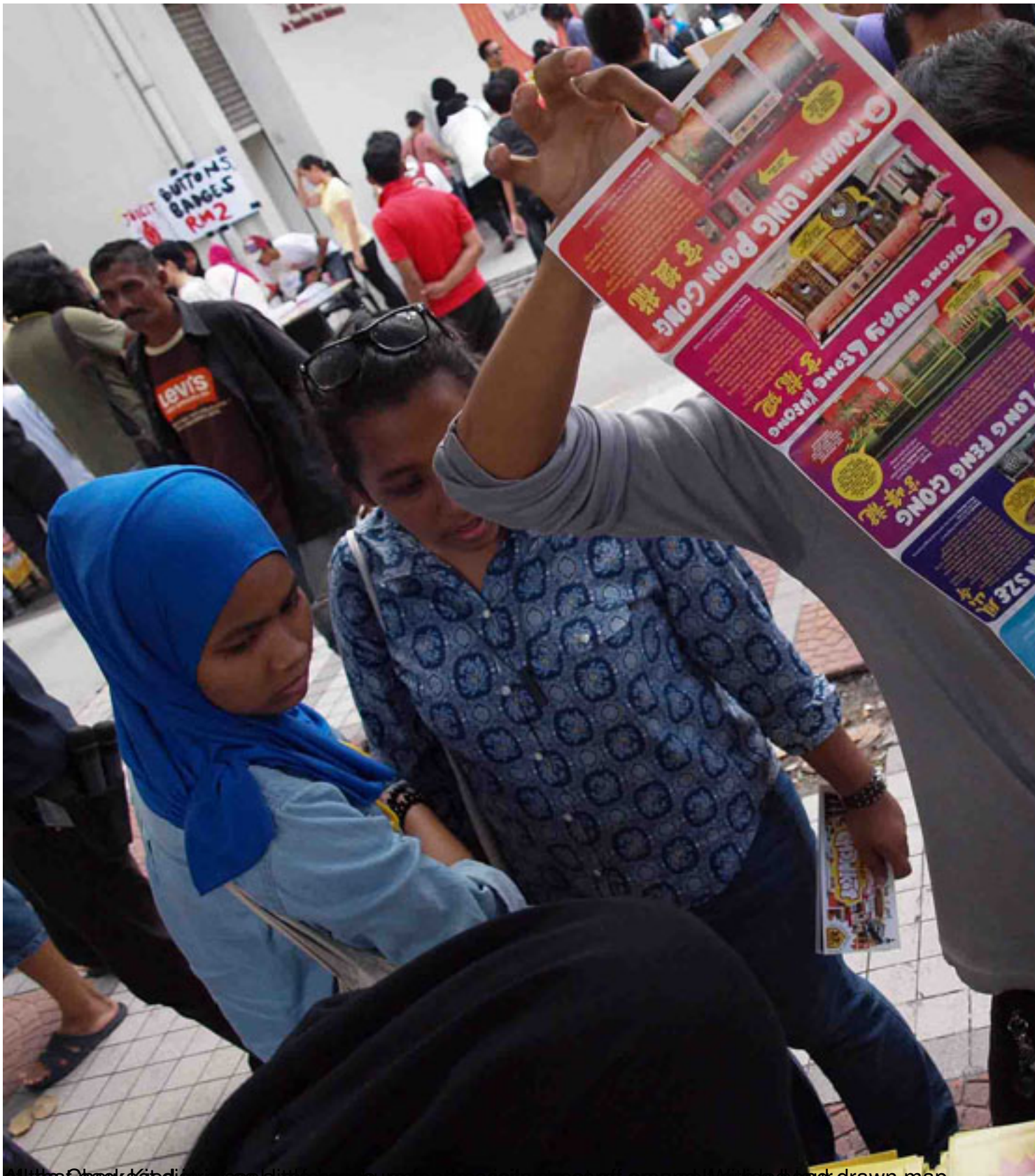
With the Open Kit guide in hand, it's a breeze to find the local area's history, culture, and a hand-drawn map