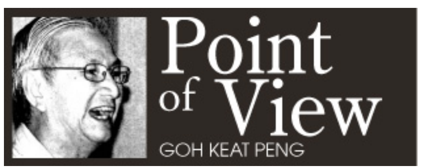
By Goh Keat Peng

First published in onGOHing (parts 1 and 2)