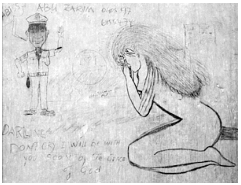
By Badan Warisan Malaysia