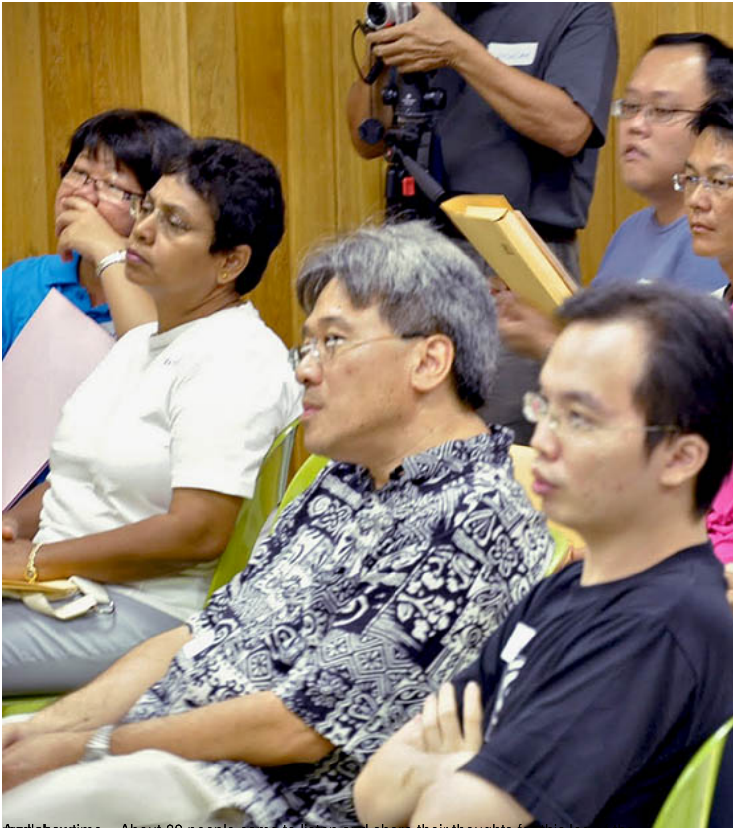
And showtime... About 80 people came to listen and share their thoughts for this leg of the